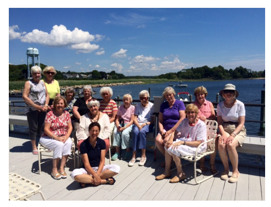
lota members enjoying the beautiful day in Stonington, as they plan for the coming year.