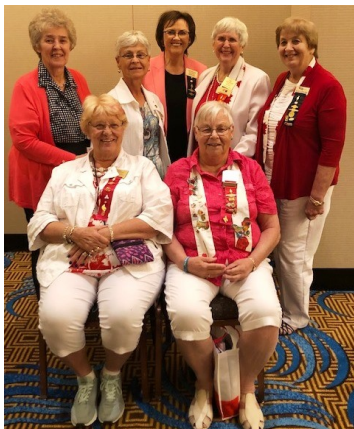
DKG Sisters From Ontario