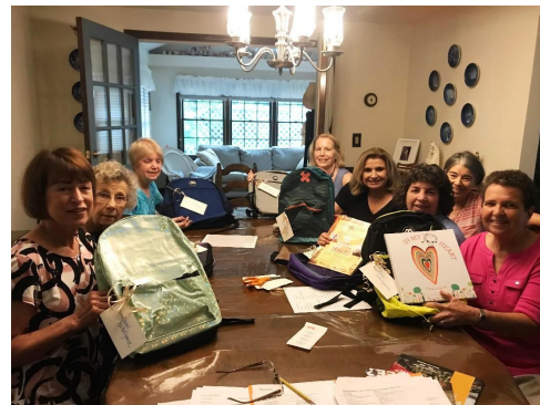
Zeta Chapter members filling book bags.