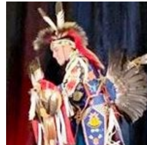
Mashantucket Pequot dancer