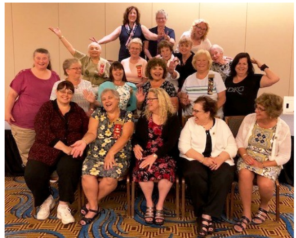
"We love NY" - DKG sisters from NY State