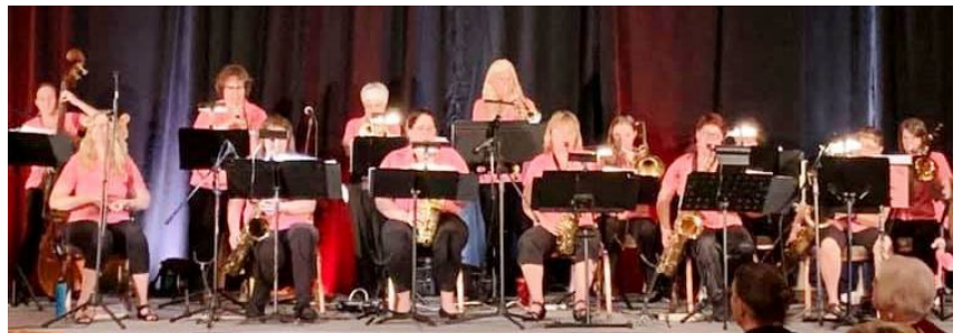
Flamingo Big Band