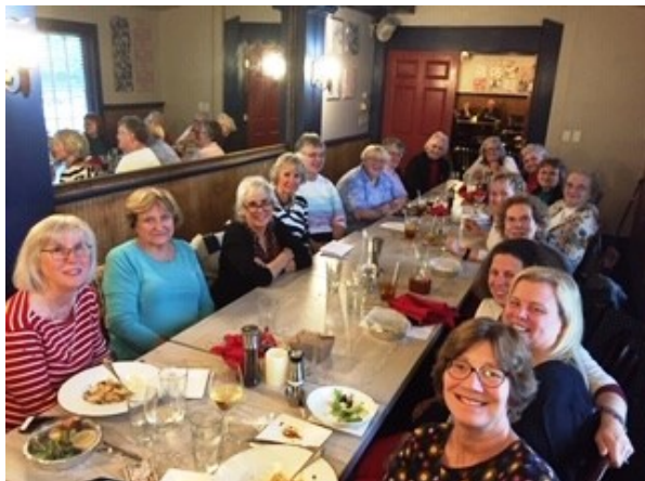
Tau Upsilon members celebrate the chapter's first birthday with a banquet.