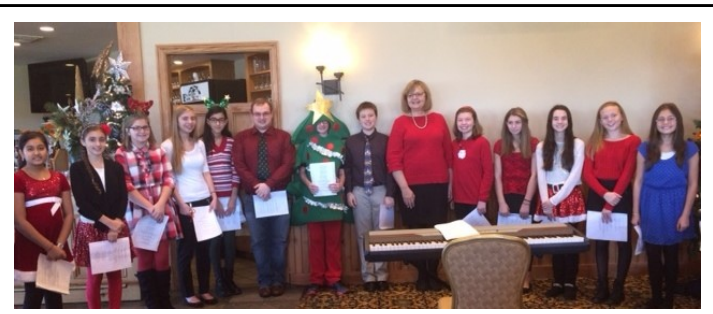
Swift Middle School students perform Christmas music for Delta Chapter members