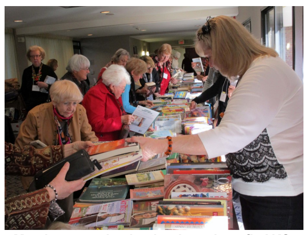
Members purchasing books to benefit AKS Non-Dues Revenue fundraiser