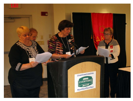
Founders' Ceremony conducted by Upsilon Chapter members