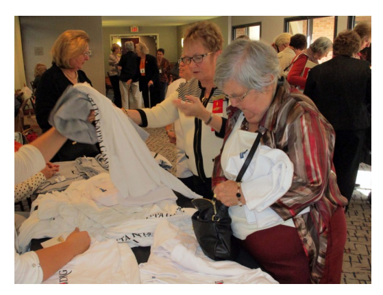
Members buying DKG shirts at Omicron Chapter fundraiser