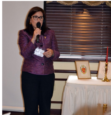
CT State Senator Gayle Slossberg speaks to attendees after being inducted as an AKS Honorary State Member.