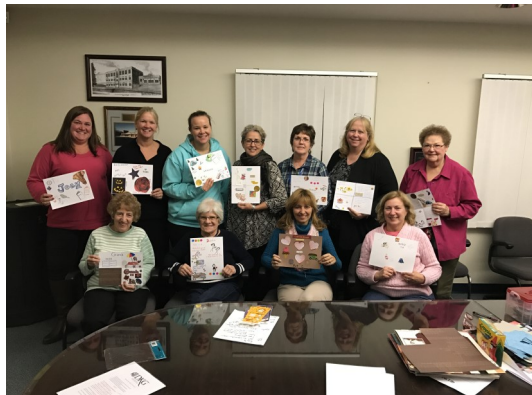
Omicron Chapter's Getting to Know You activity

On December 4 th , Omicron Chapter held its annual Holiday Tea at Kellogg Environmental Center in Derby. Omicron members and their guests enjoyed a brunch together. Members also made and donated baskets to be raffled for Omicron's annual scholarship fund. Tours of the Osborne Homestead Museum were offered as well.