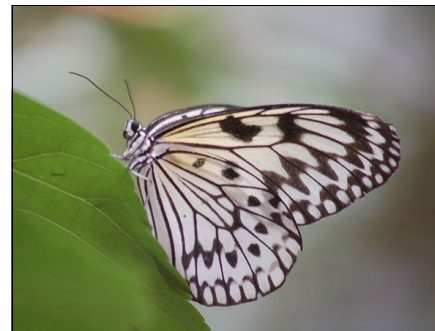
Butterfly at Rest - Judith Baxter